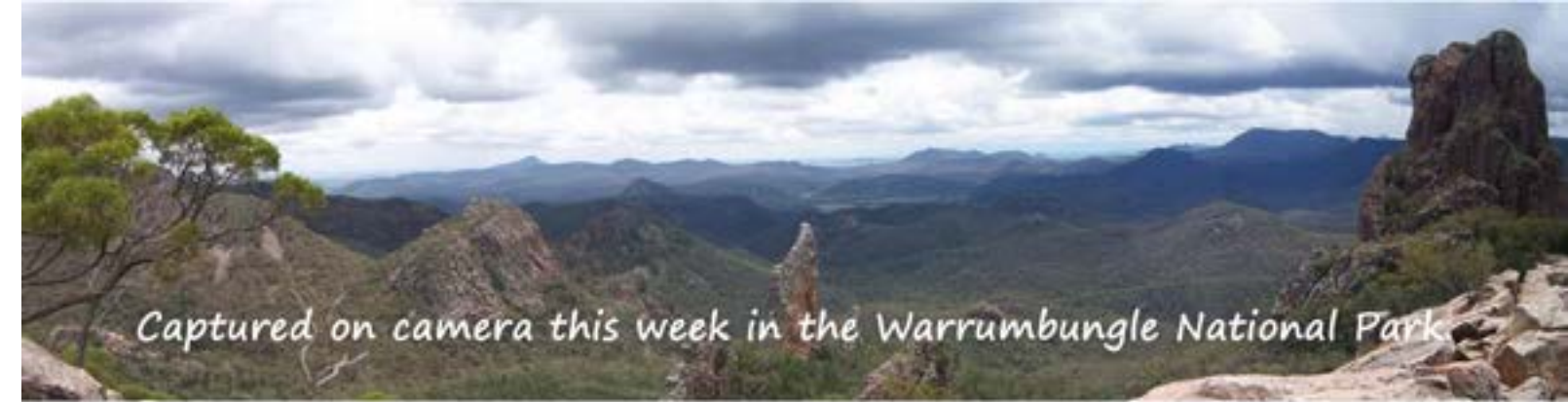
Captured on camera this week in the Warrumbungle National Park.

We have had a great term together in 2C. We are a hardworking and cooperative class who try hard to follow the schools PBL values and are always respectful and polite. We are looking forward to achieving even more in term 3 as we get ready for Year 3.