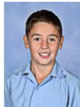
North West Trials Rugby Union Football