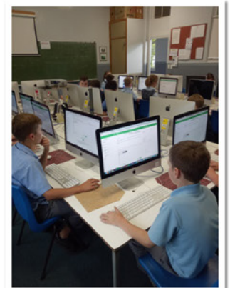
5/6L students learning Javascript to draw simple shapes to make a snowman.