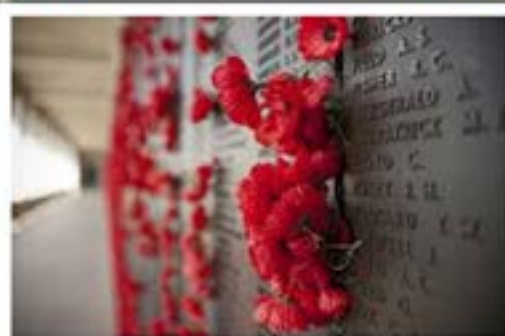
Remembrance Day 11th November 2014