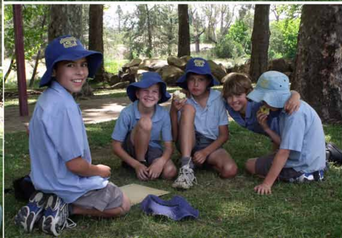
Year 4 enjoying lunch in Neilsen Park after drawing some of our town's local landmarks.